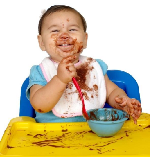
This is a messy time, so a good supply of bibs will come in handy.

By 4-6 months, babies can begin eating soft, semi-solid foods. Soon after that they take an interest in what other people are eating and drinking. As their fine motor skills develop they learn to bring food to their mouths, and sometimes get it in! They also learn to hold and drink from an open cup.