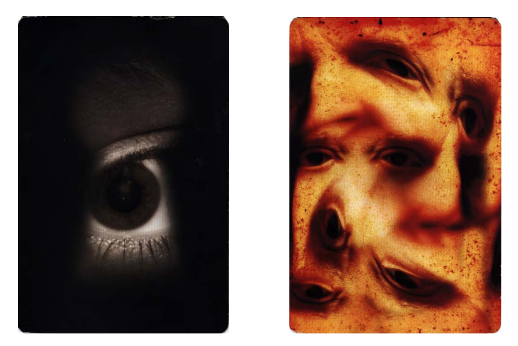
You always have to keep your eye on the little one, especially when they're newborns. I've always been afraid that if I don't check on them all the time, they could stop breathing or something.